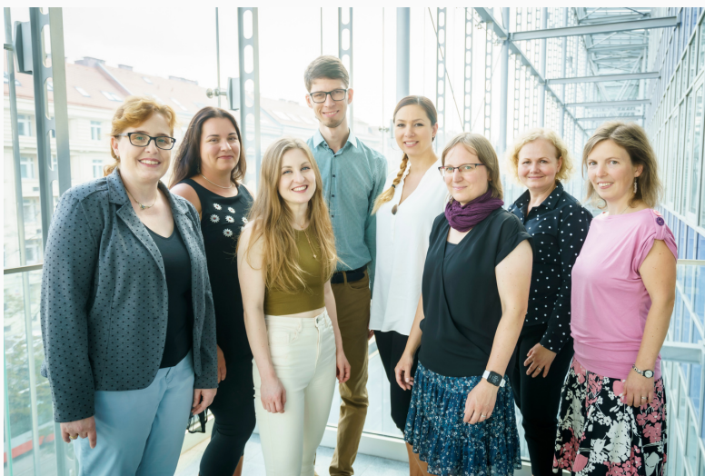
Part of our library team

Blog – provides important news in the library and in the field of Information science